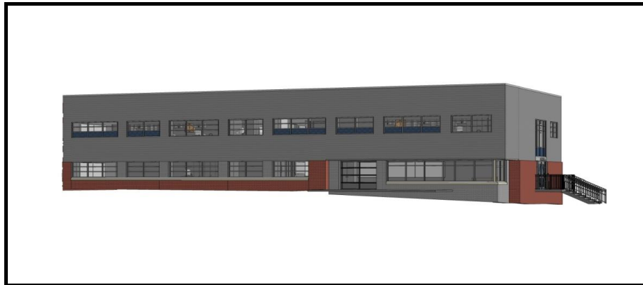
3D Render View